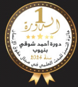
جائزة التميز للبحث العلمي في مجال حقوق الإنسان • صنف أطروحة الدكتوراه • صنف أحسن مقال علمي للباحثين الشباب